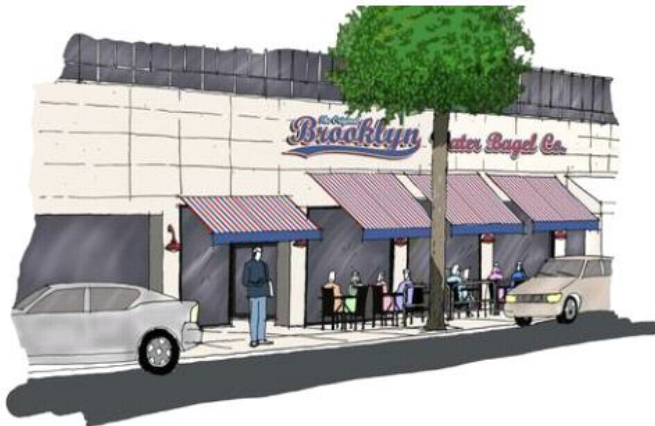
THE ORIGINAL BROOKLYN WATER BAGEL CO. An artist's impression of the new store front.